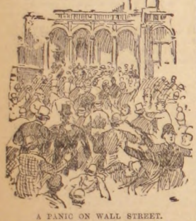
A PANIC ON WALL STREET.

ONEATRY crises have not been confined to the modern era, but the term panic did not begin to be applied to them until comparatively recent times.