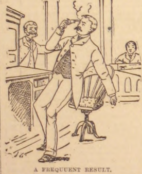
A FREQUENT RESULT.

The panic of 1873, the latest of the country's financial convulsions, was caused chiefly by the excessive railway building.