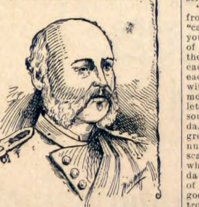
GEN. JOHN M. SCHOFIELD.

GEN. JOHN M. SCHOFIELD. Celebration of Their Nuptials at the Home of the Bride.