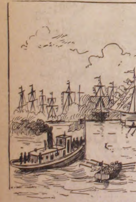
FIRING THE NAVAL SALUTE.

A man sentenced to be hanged is above suspicion.