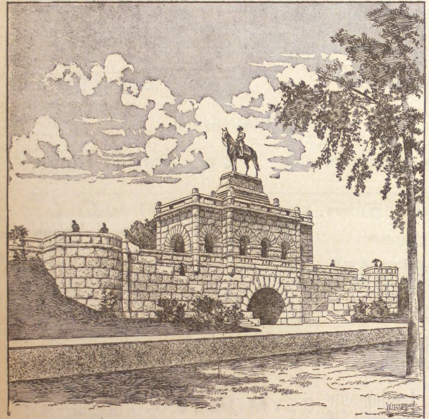
THE GRANT MONUMENT—VIEW LOOKING WEST.

"I HATE TO ASK MY DOCTOR." False modesty and procrastination are responsible for much female suffering. We can excuse the instinctive delicacy that suggests concealment to the young, but there is no excuse for those who reject the assistance of a woman. LYDIA E. PINKHAM'S Compound is an entire and permanent cure for the worst forms of female disease, and instantly relieves all weaknesses and ailments peculiar to the sex. It is sold by all Druggists as a standard article, or sent by mail, in form of Pills or Lozenges, on receipt of $1.00. Dr. Pinkham's Compound is sold in Health and Hygiene, a monthly illustrated, sent on receipt of two 5-cent stamps. Lydia E. Pinkham Med. Co., Lynn, Mass.