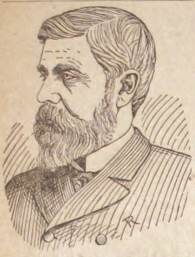
WALTER Q. GRESHAM, ORATOR OF THE DAY.

Tribute to the Dead. Sunshine and rain warred fiercely and unremittingly with each other in Chicago to determine which would have the victory when it came to unveil the Grant statue. And Phobos won a dazzling victory, and all the people rejoiced. It would have been a bitter disappointment had it been ordered otherwise. The silken cords were gently pulled by the fair hands of the