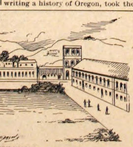
PRACA DA ACCLAMACAO.

The love of flattery in most men proceeds from a mean opinion they have of themselves; in women from the contrary—Swift.