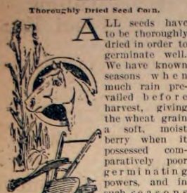
Thoroughly Dried Seed Corn.

Good Results from Thoroughly Dried Seed—How to Shoot a Beef—Value of Corn Meal for Feeding—Foultry Notes—Household and Kitchen.