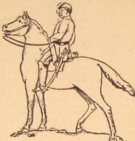
THE EQUESTRIAN STATUE OF GEN. GEORGE B. M'CLELLAN.

A life-size equestrian statue of Gen. George B. McClellan, one of the finest equestrian works of bronze in this country, will be unveiled in Philadelphia on Sept. 17, 1892, the thirtieth anniversary of the battle of Antietam. It will be mounted upon a high, massive pedestal of granite, handsomely inscribed with bas-reliefs of bronze. The ceremonies attending