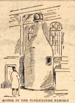
BOOTH IN THE VITICULTURE EXHIBIT.

the plaza in front of the Government building, where 50,000 people could see the exercises even if they could not hear the speeches, was opposed by Director of Works Burnham, who said the