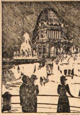
THE ELECTRICAL FOUNTAINS.