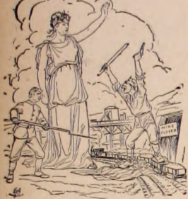
ILLINOIS TO THE RAMPANT COAL MINER: "Hold on—This has gone far enough!"

Quail Before Militia. The situation in the Indiana mining regions, according to an Indianapolis dispatch, indicates that the troops at Cannelburg at least will be suppressed without an encounter with the militia.