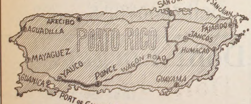
PORTO RICAN MAP AND ROAD SCENE. The map shows the island of Porto Rico and the principal routes thereon.