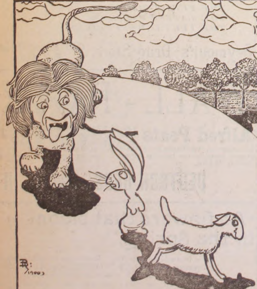
The March hare led a troubled life. The lamb, she bored him sadly. And when the lion came and roared it always scared him badly.