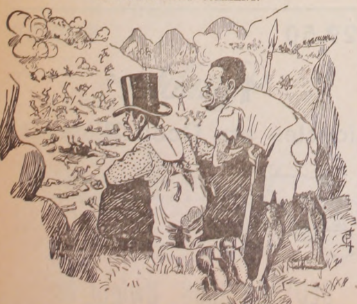
"They are horrified that we sometimes roast a man, but they slaughter each other by thousands!"