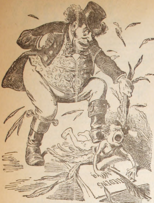
"Well! This bird has annoyed me long enough flapping its wings in my face and buzzing around my ears!"—Kikerik.