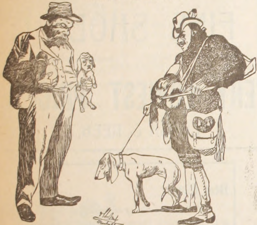
Amateur Sportsman (angrily): "Look here, you! That dog that I bought from you doesn't know how to retrieve game!" Dog Dealer: "Well, he doesn't have to as long as you own him."