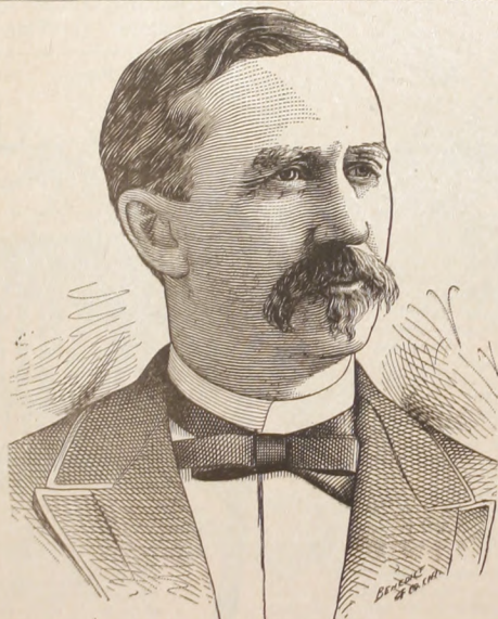
WALTER REEVES, FOR CONGRESS.