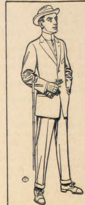
The Master Suit Copyright 1912, Alfred Decker & Co. Inc.