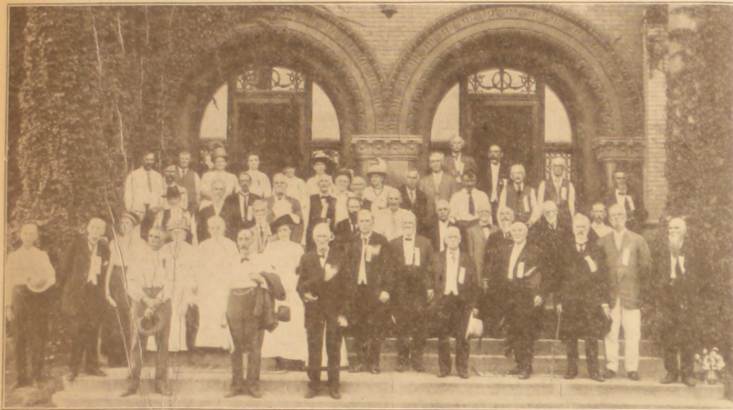
GROUP PICTURE TAKEN ON THE STEPS OF THE LESLIE E. KEELEY COMPANY'S LABORATORY.