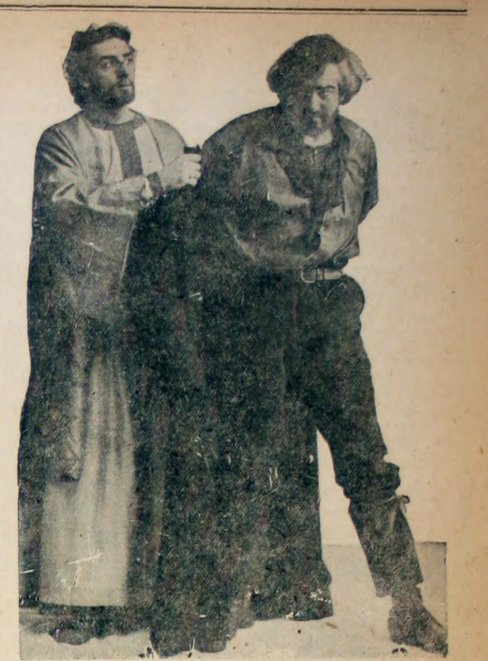
Scene from "The Servant in the House" Wednesday, Sept. 18th Dwight Opera House

PARKER'S HAIR BALSAM Cleanses and beautifies the hair. Promotes a luxuriant growth. Never Falls to Restores Gray Hair to its Youthful Color. Prevents hair falling. 50c and $1.00 at Druggists.