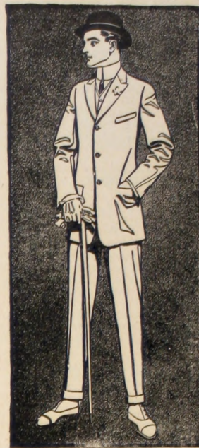
The Bristol Suit