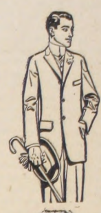
Society Brand Clothes

Agency for Society Brand Clothes For Young Men And Men Who Stay Young