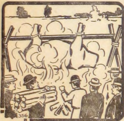
A Roast of Beef!