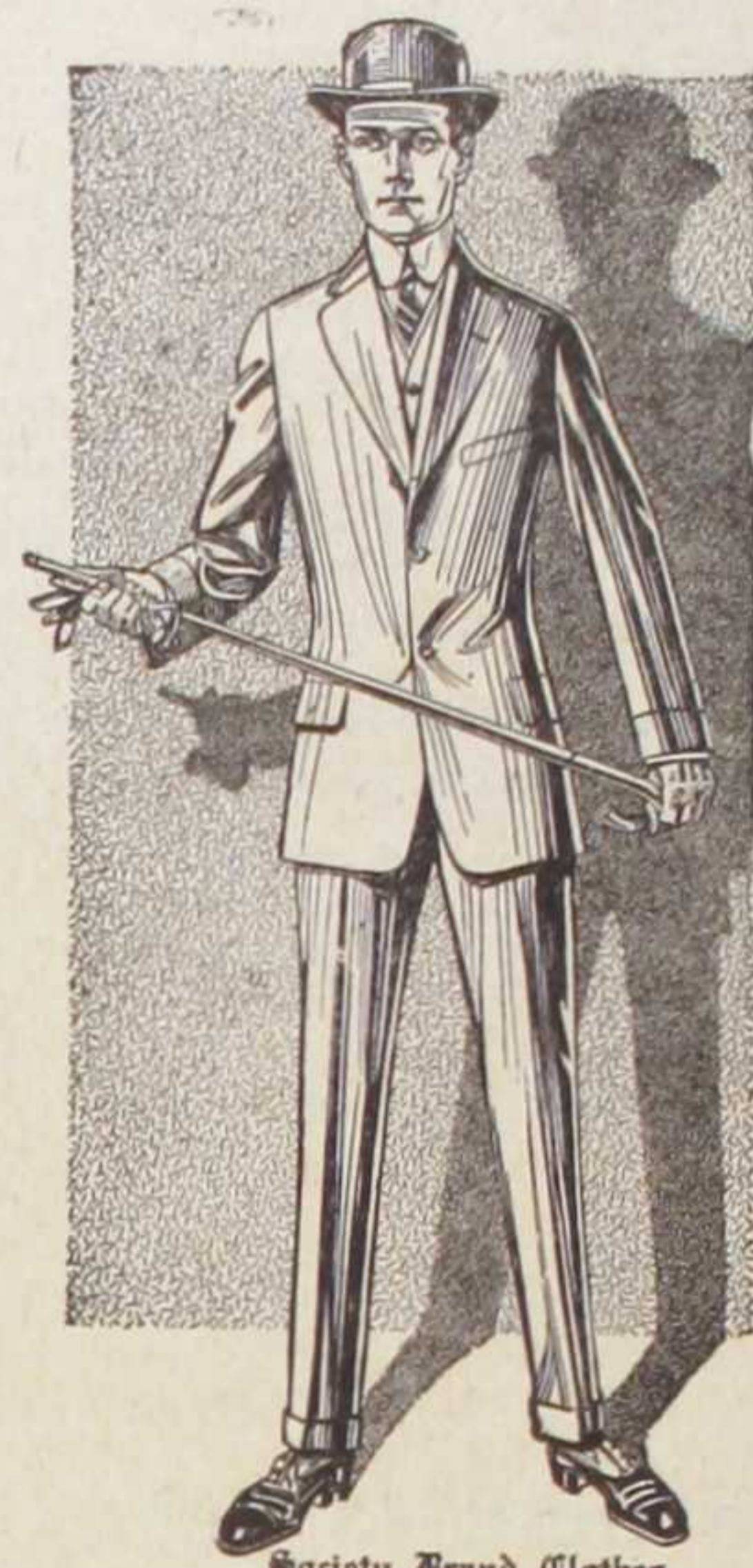
Society Brand Clothes Copyright 1924. Alfred Decker & Co.

and insist on seeing the new spring models of Society Brand Clothes.