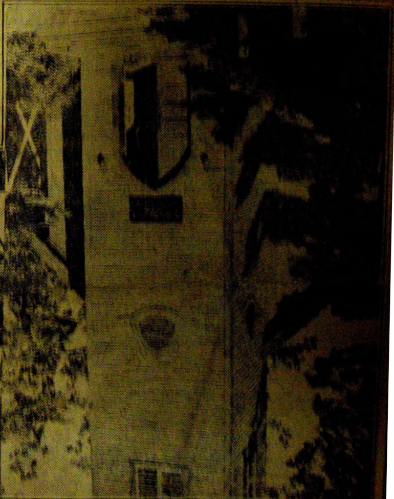
TWO FAMOUS RURAL CHURCHES