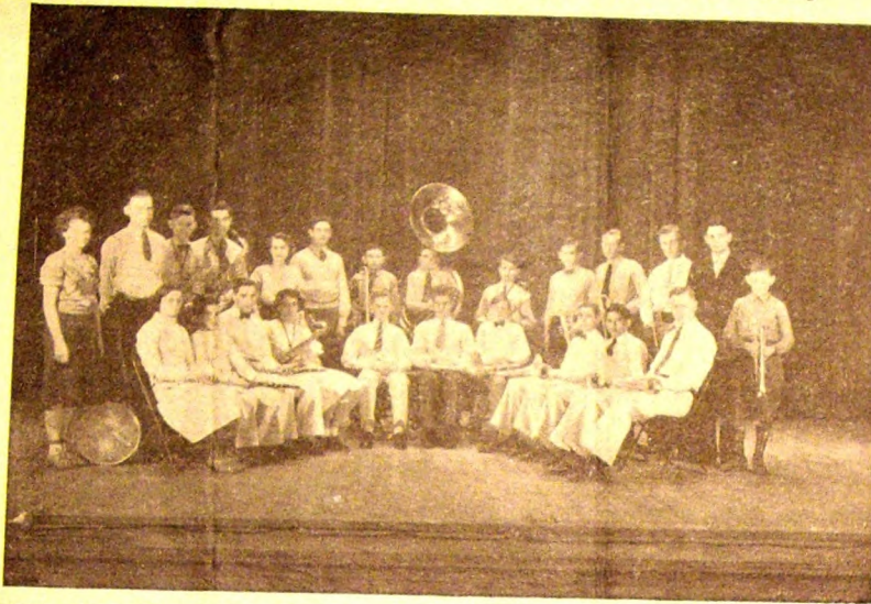
The Dwight Township High School Band pictured above will play along with the St. Charles School for Boys Band of 40 pieces and the Soldiers and Sailors Orphans Home Band of 40 pieces at the celebration here Sunday in observance of the reopening of the Veterans Hospital here. The celebration is sponsored by Dwight Post 486, American Legion.