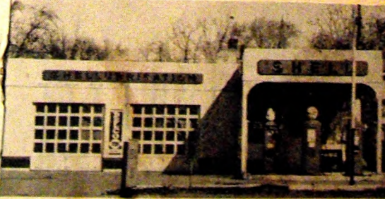
S. C. SCOTT SHELL SUPER-SERVICE STATION

The Blackstone is one of the finest showhouses in this part of the state, presenting only the best obtainable in motion picture entertainment. Attend the Blackstone often and relax in the comfortable deeply cushioned seats.