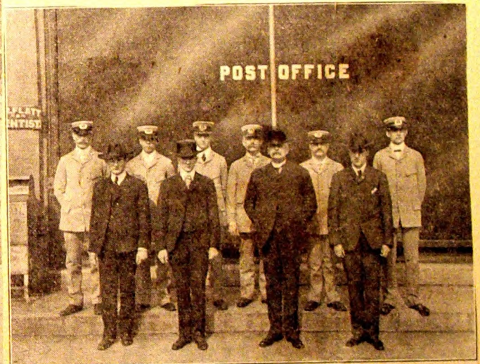
POSTOFFICE FORCE OF LONG AGO