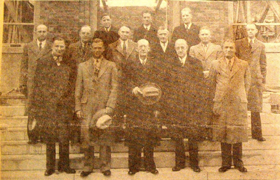
DWIGHT POSTOFFICE FORCE OF 1936