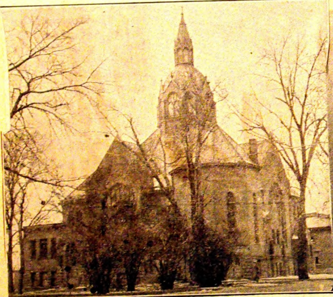
PRESENT METHODIST CHURCH BUILT IN 1902