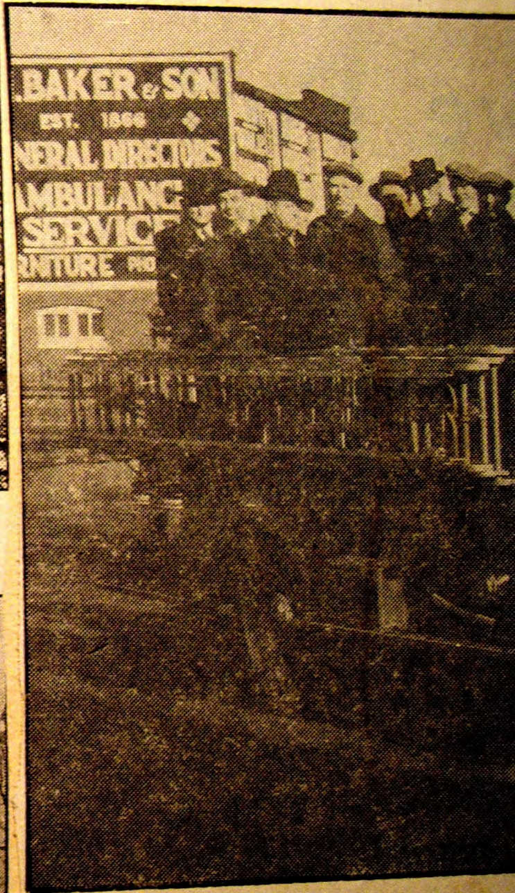
NEW FIRE TRUCK PUR