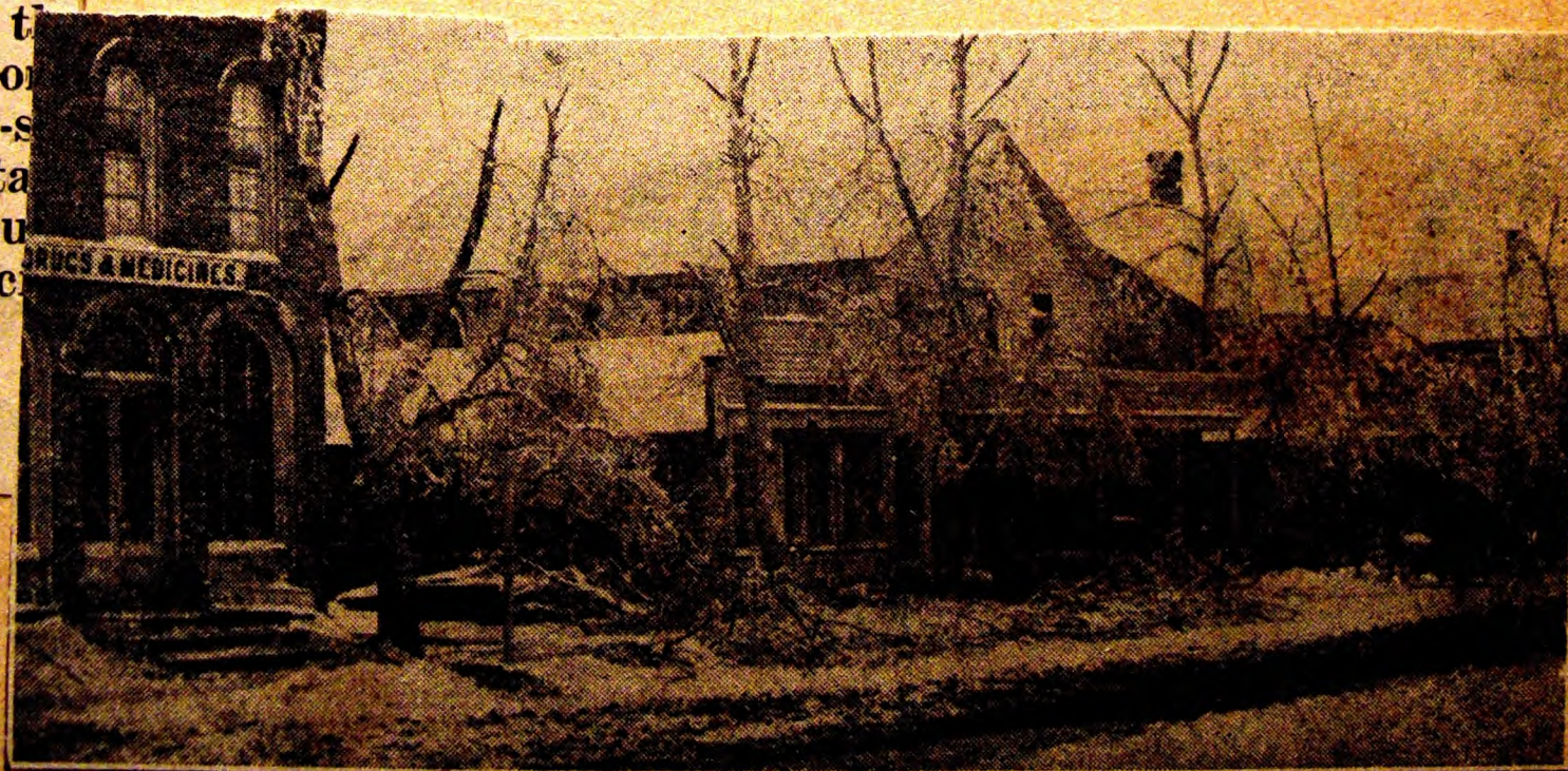
SOUTH END OF EAST STREET IN 1870

1924. The th. There Along t main roo twenty-s e subst ant hou any soc years, ounds.