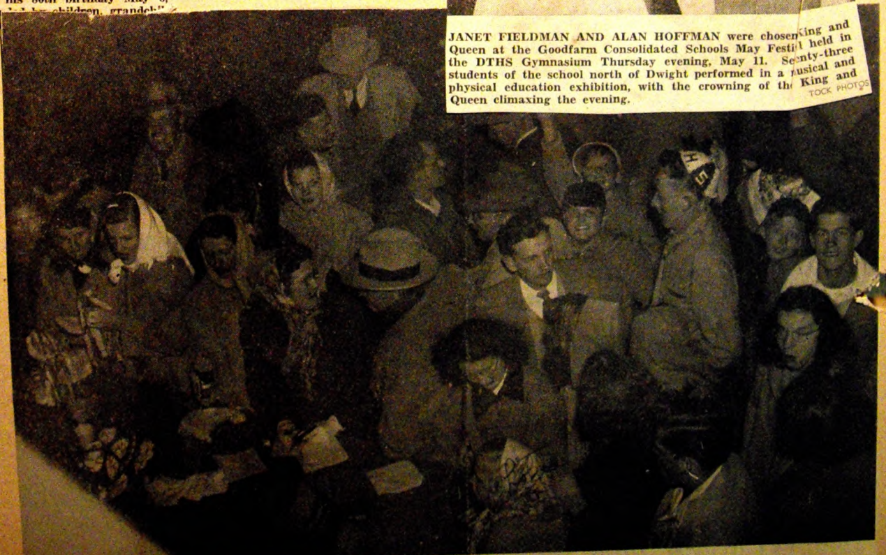
View of wild clamor at Senior Class Hot Dog and Coffee Stand during half period of Chenoa-Dwight Football Game at newly-lighted Oughton Recreation Field Friday night, September 26. Are you there?